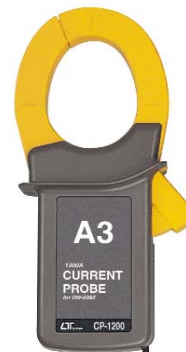
Clamp probess, A1, A2, A3 CP-1200